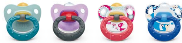
NUK Classic Soft

Quality right from the start: NUK Classic Soothers are still as good a choice today as they were in the past. Both natural and shaped to fit the jaw and with modern colours and motifs, the NUK Classic has accompanied children through the first years of life for generations.