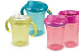
Easy Learning 1-2-3 Cups