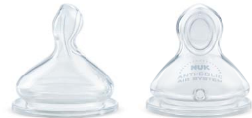
First Choice + Silicone Teats

*For an optimal combination of bottle and breastfeeding. Moral et al. BMC Paediatrics 2010, 10:6. For further information go to http://en.nuk.de/all_about_nuk/studies