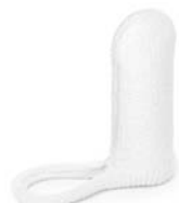
Oral Care Finger