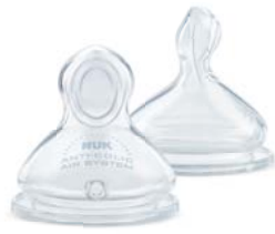
First Choice + Silicone Teats