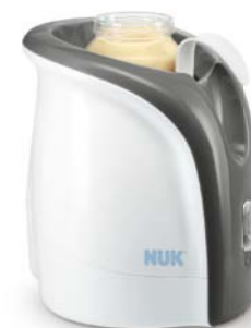
Thermo Ultra Rapid Baby Food Warmer

Thanks to its wide opening it is easy to clean as well, while the 12 V adapter that comes with it makes it practical for when you are out and about, letting you use the NUK Thermo Ultra Rapid in the car or camper. Within the shortest time milk or solids are ready for use – and the passenger on the back seat is completely satisfied once again. Have a good trip!