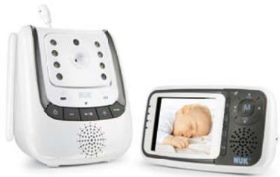
Babyphone Eco Control + Video