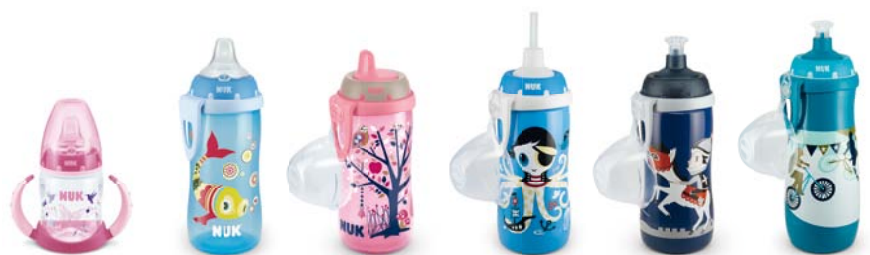
First Choice Learner Bottle

All NUK Bottles quench great thirsts and are extremely sturdy. And they can be combined together: the tops and cups are interchangeable. And because they should also make the daily routine easier for mothers, after a tumble into the sandpit it is quick and easy to clean and put them together again – ready for the next adventure!