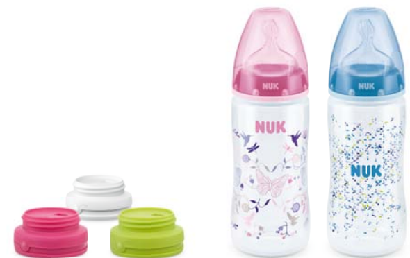
First Choice Open & Close System

PS: For the really fashion-conscious there are even new Trendline soothers in the same design!