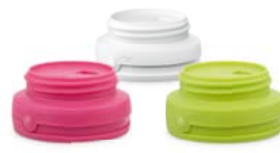
First Choice Open & Close System