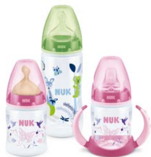
First Choice PP Bottles