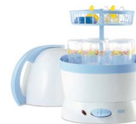
Vapo 2 in 1 Steam Steriliser