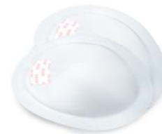
Ultra Dry Comfort Breast Pads

Along with various breast pumps, NUK also offers you other helpful breastfeeding products which help in the day-to-day routine: for example, different types of breast pads, which all reliably absorb breast milk and protect your clothes. Or NUK Nipple Shields in silicone: they protect sensitive, irritated nipples and, due to their unique shape, still keep skin contact while breastfeeding.