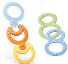
Connect-and-Play Teething Ring Set and Teething Ring