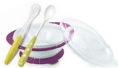
Feeding Spoons and Eating Bowl

The NUK Easy Learning Plate and the NUK Easy Learning Cutlery Sets complete the practical range. The plate has an "anti-slip" base so that it can also stand safely on the table. The Mini Cutlery is a plastic spoon and fork with rounded edges and prongs and is the perfect size for little hands and mouths. Once the first independent attempts at eating are successful, at around 18 months you can turn to the NUK Easy Learning Maxi Cutlery Set. Its spoon, fork and knife are of high-quality stainless steel and, thanks to their "anti-slip" plastic, the handles can be gripped well by a child's hand – and in proud children's eyes, they almost look like the cutlery of the grown-ups.