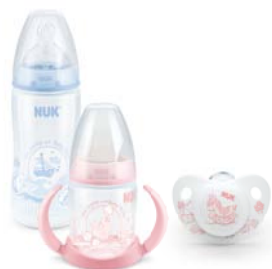
Rose & Blue