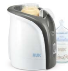
Ultra Rapid Baby Food Warmer