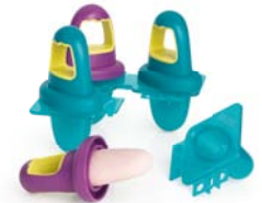
Freshfoods Ice Lolly Set