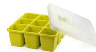
Freshfoods Food Cube Tray