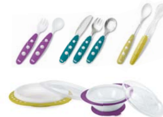
Easy Learning Tableware