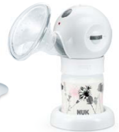
Luna Electric Breast Pump