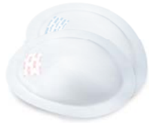
Ultra Dry Comfort and Night Breast Pads