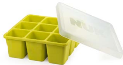
Food Cube Tray