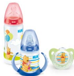
Winnie the Pooh