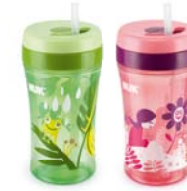
Easy Learning Fun Cup