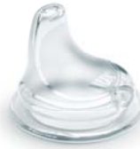
First Choice Silicone Spout