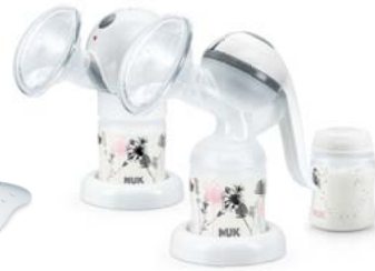
Breast Pumps and Breast Milk Container