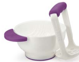
Freshfoods Masher & Bowl