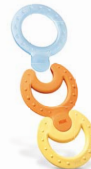
Connect-and-Play Teething Ring Set

And once the little teeth are finally there, then it's time to clean them like the grown-ups do! The soft bristles of the NUK Starter Toothbrush protect the gums and won't do any harm if there are any slip-ups. Parents should do another thorough follow-up of course. For only with well-looked after teeth can you really get your teeth into things.