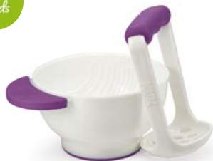
Masher & Bowl