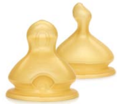
First Choice + Latex Teats