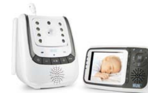
Babyphone Eco Control + Video