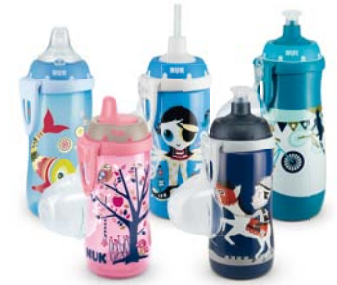
Active, Kiddy, Flexi, Junior and Sports Cup