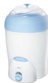
Vapo Rapid Steam Steriliser