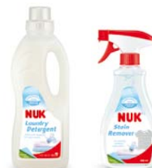
Laundry Detergent & Stain Remover