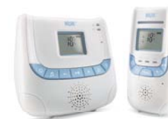
Babyphone Eco Control +