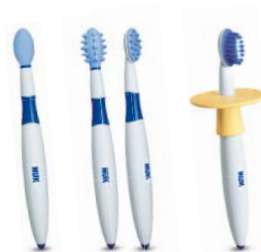
Cooling Stick, Training Toothbrush Set & Starter Toothbrush