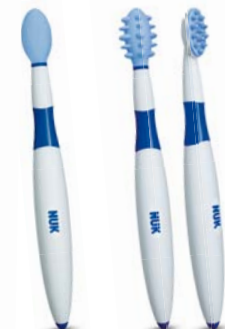
Cooling Stick and Training Toothbrush Set