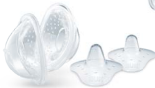
Nipple Shields and Breast Shell Set