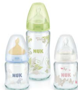
First Choice Glass Bottles